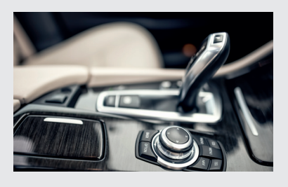
Fixtures, furniture and fittings